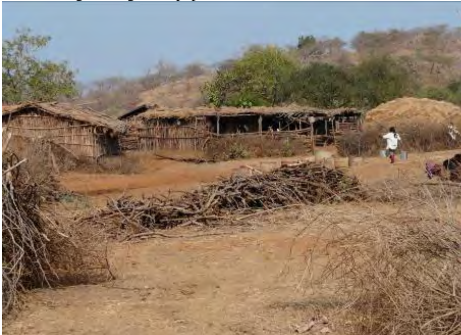
Indigenous settlement in Gir National Park

The main reason for visiting the Gir Forest is the endangered Asiatic Lions although Gir is great for wildlife. The mosaic of dry deciduous forests, acacia scrub and grasslands make this a birding and wildlife bonanza. Although the park was created to save the Asiatic Lion and many people were relocated from the area, a great many families live in the park with their herds of cattle. At the lodge we prepared to go birding but the paperwork had to be completed and complex negotiations ensued to arrange for it to be done after dark. The complexity of arrangements for jeeps, drivers, park guides and entrance fees plus the mandated tips was daunting. Still thank god we got the paperwork done, shame we lost so much birding time doing it.