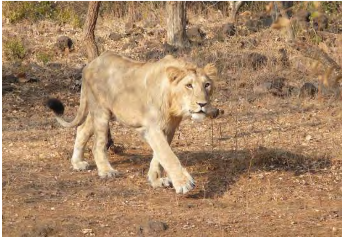
Male Asiatic Lion