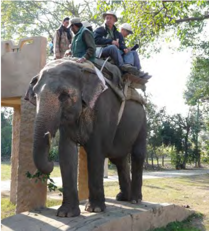
Our Elephant ride