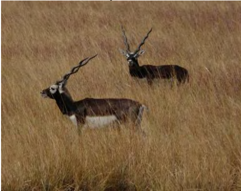
Blackbuck at Velavadar NP

At dawn, the next morning, we returned to the park and headed to a low watch tower overlooking the grasslands. In no time we saw a single wolf drag down a young Nilgai and try to kill it. Although rather horrific, this was the stuff of epic wildlife programmes. After ten minutes or so it seemed the young animal was dead and the single Wolf tried to drag it towards some scrub. The next moment 2 Striped Hyaenas were seen running towards the Wolf and there ensued a frenzied chase as a Hyaena pursued the Wolf across the plains in a huge circle. The Wolf outran the Hyaena and sat at a safe distance to watch the Hyaena finish off the Nilgai, which it subsequently abandoned. The wolf then returned to its prey. The whole drama was an extraordinary spectacle and watching 2 of the most elusive mammals in India kill and fight over a carcass was one of the most memorable moments of the trip.