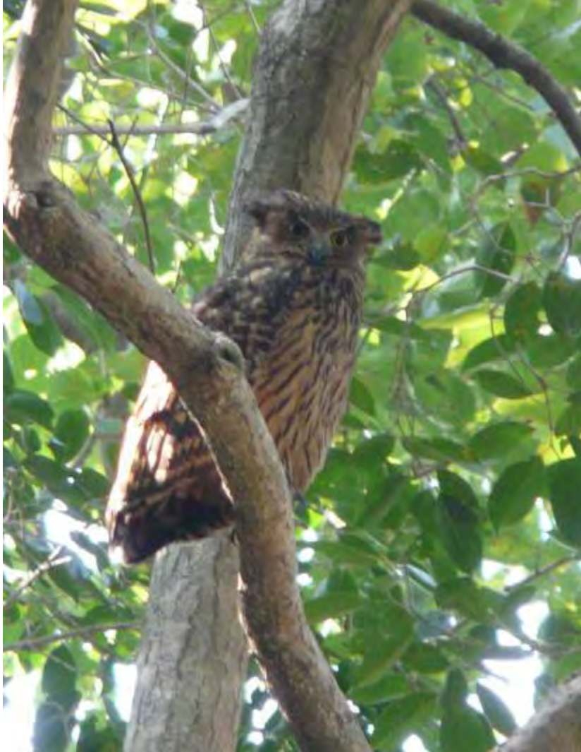
Tawny Fish Owl

After an indifferent lunch, the group split up with some taking an elephant ride while the rest of us drove the trails through the nearby grasslands. Dhikala, is a lovely location and the opportunity it affords for the government to develop tourism in the area is seriously hampered by its surly legions of drivers and park officials permanently grinning as they stand about in the expectation of being given a tip.