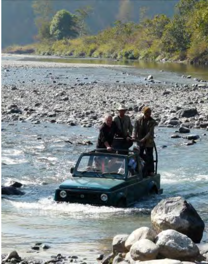
Departing from Riverine Woods Camp

Woodpeckers. After lunch we headed north to the new Riverine Woods Camp where we saw Great Hornbill, Black-chinned Babbler, Wallcreeper, Little Forktail, Lesser Fish Eagles, Pallas's Fish Eagle.