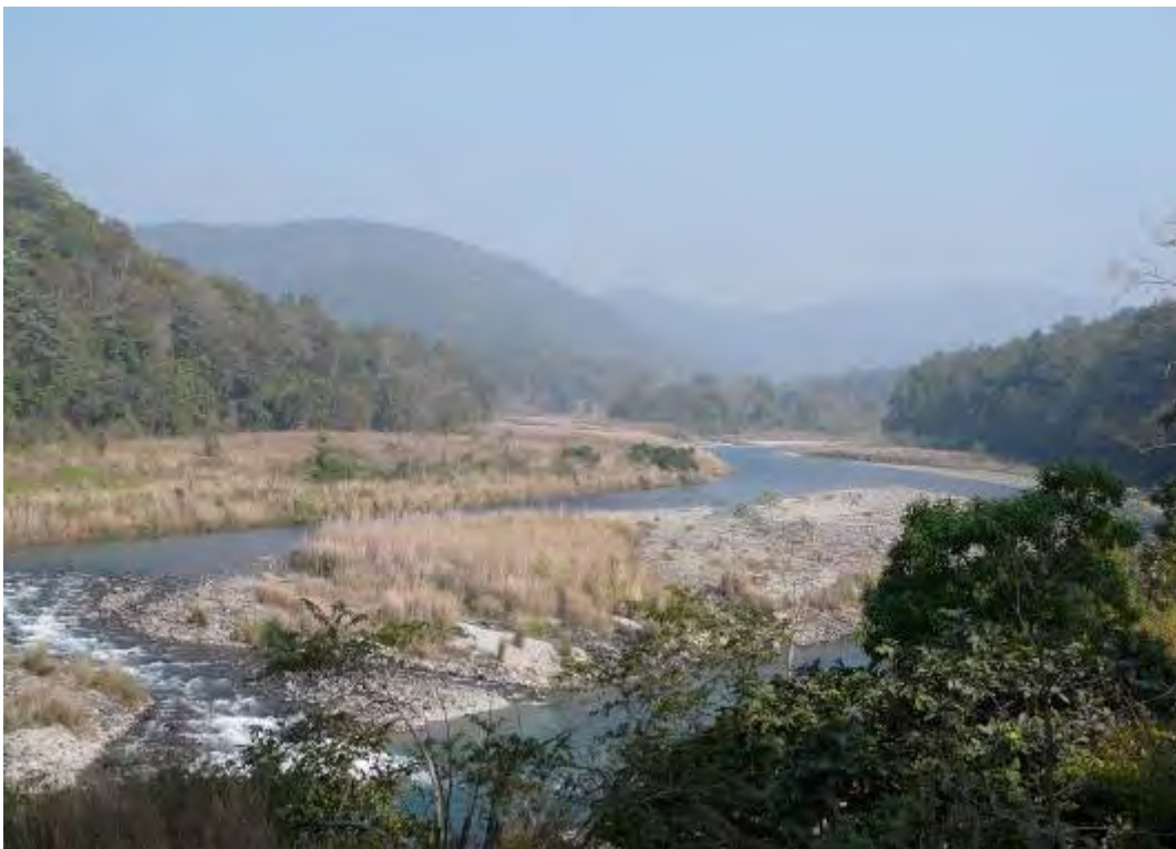
Corbett National park.

We spent the next morning at Sultanpur after which we took the sleeper train to Haldwani and Kathogdam. Arriving at 6am we drove west to Corbett NP and passed through endless miles of pristine forest to Dhikala on the western side of the park; a beautiful location comprised of extensive grasslands and Sal woodlands adjacent to a lake.