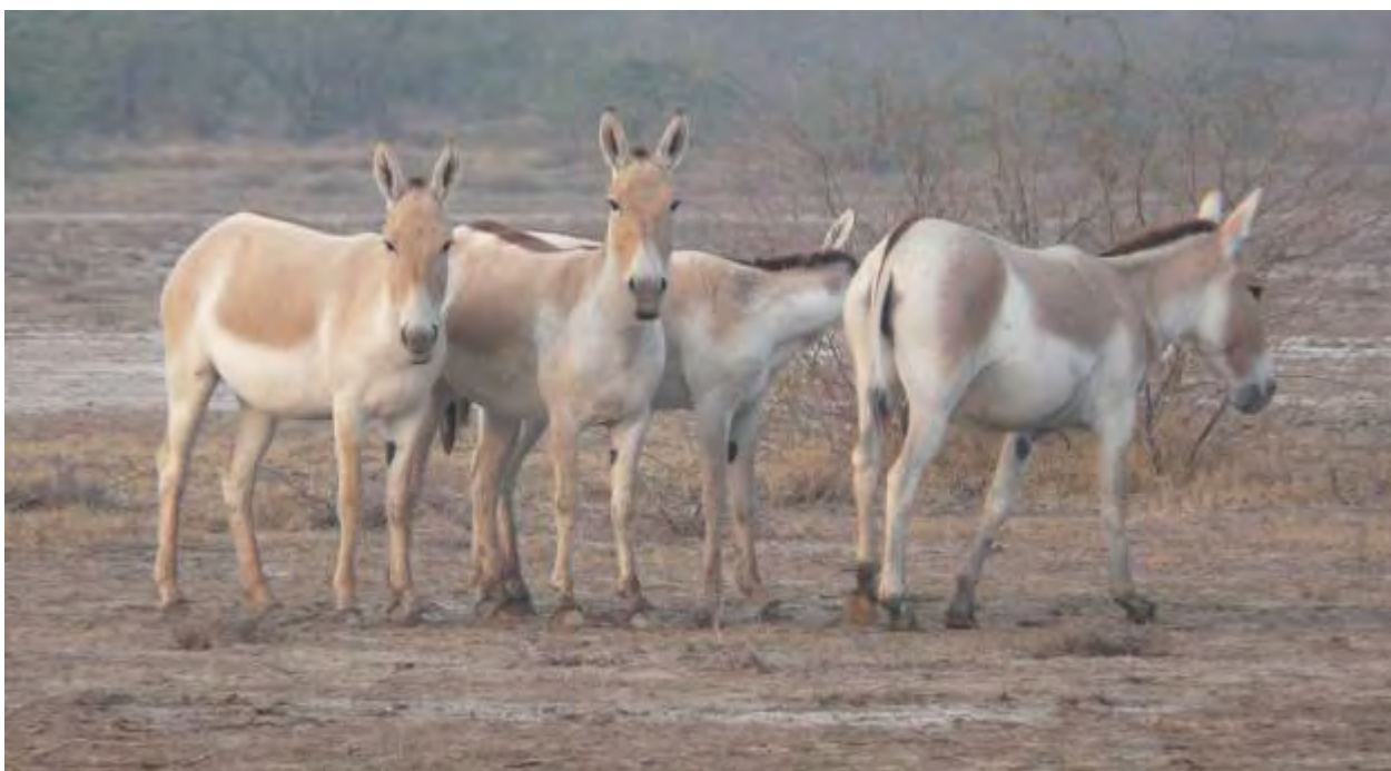
Asiatic Wild Ass

The next morning we had an early breakfast and then drove to the Little Rann of Kutch, a sanctuary for the Asiatic Wild Ass. This huge region is dominated by an ancient seabed turned to saline desert plains. We quickly located a herd of Asiatic Wild Asses and spent some time watching these beautiful animals.