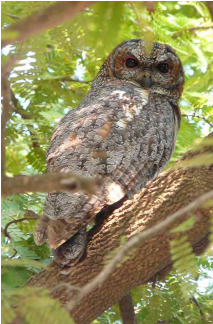
Mottled Wood Owl

Another journey loomed before us as we left of Gir Forest for the unknown delights of Bhavnagar and the Velavadar NP. On the way we saw a nice herd of Indian Gazelle and several Jackals along with huge flocks of Ashy-crowned Finch-Larks, Short-toed Larks and Tawny Pipits. On the way we did see good numbers of Pallid and Montagu's Harriers hunting over the endless cotton fields.