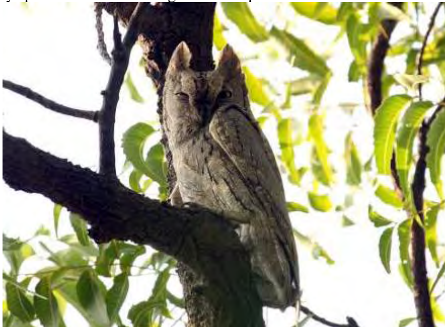
Pale Scops Owl

The following morning we returned to Delhi airport to catch our flight to Ahmedabad where we met up with our local guide, Rathan. In the airport car park, we witnessed the now rare sight of White-rumped Vultures and maybe 3 Indian Vultures wheeling over the runway, the only vultures we saw in the area. We drove for 2.5 hours to Rann Riders near Dasada on the edge of the Little Rann of Kutch. At Rann Riders we found Pheasant-tailed Jacana and a flock of Sand Martins, the latter a vagrant to the region. This became a feature of birding in this area as we recorded a good many species not mapped as occurring in this part of Gujarat. We had a pleasant lunch and drove to a known wintering site for Pale Scops Owl. After some searching, a local guy spotted the bird roosting above our parked vehicle.