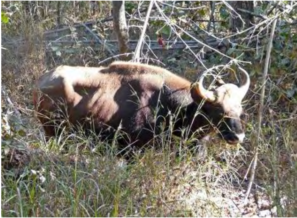
Gaur ( Bos gaurus ) A total of 20 seen in Kahna NP. An impressive beast.