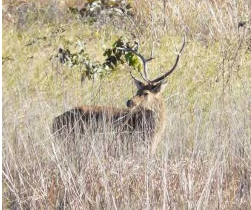
Barasingha ( Cervus duvaucelii ) Up to twenty seen in Kahna NP