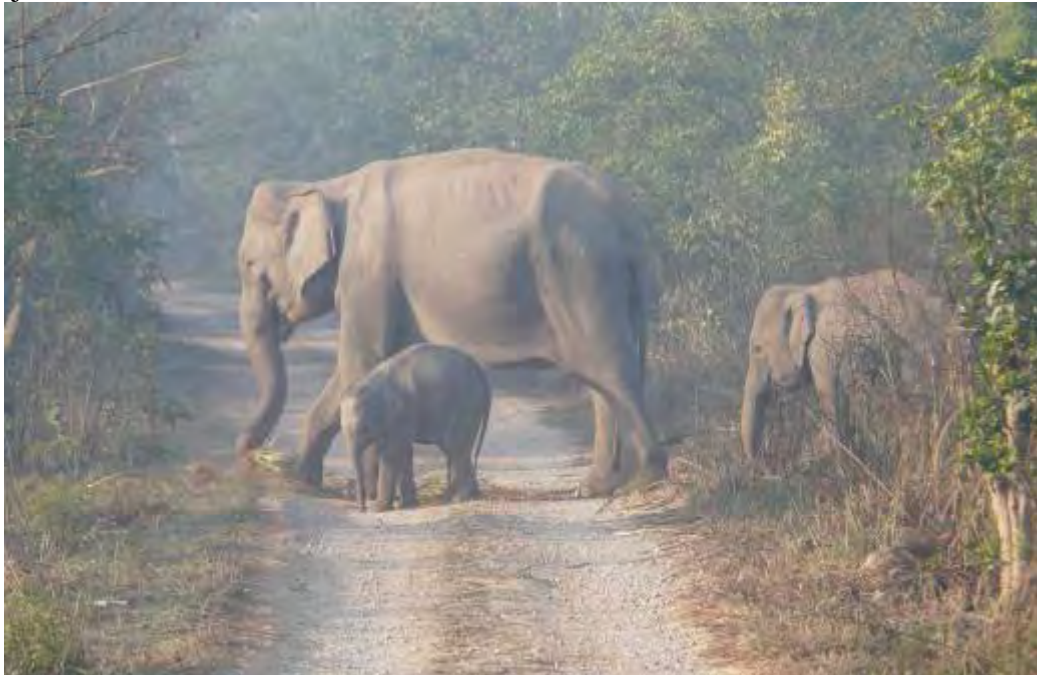
Female Elephant with young

homilies to drivers along the central reservations which although amusing are brought sharply into focus when suffering the horrors of the road. The following examples are instructive... 'Impatient on the road...patient in hospital' ... or ... 'this is a highway, not a runway'. However, the best is ... 'arrive in peace not in pieces' ... I think 'go plane and train only' is the best advice, as these roadside homilies are not heeded. We did see the most spectacular head to head collision of 2 huge trucks along the highway. This resulted from one of the vehicles careering along the hard shoulder of the wrong side of the highway to avoid a traffic jam.