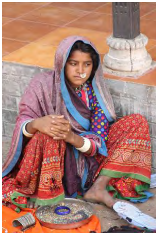
Girl at Rann Riders

We saw Crested Serpent Eagle, Bonneli's Eagle, a stunning male Asian Paradise Flycatcher, Tickell's Blue Flycatcher, Yellow-fronted Pied Woodpecker, Indian Pygmy Woodpecker and Black-rumped Flameback, Plum-headed Parakeet, numerous Rufous Treepies, Large Cuckoo Shrike, White-bellied Minivet and several groups of Tawny-bellied Babbler. The most spectacular bird was undoubtedly the Mottled Wood Owl, subsequently most consistently billed as bird of the trip, in a tree with branches overhanging the road.