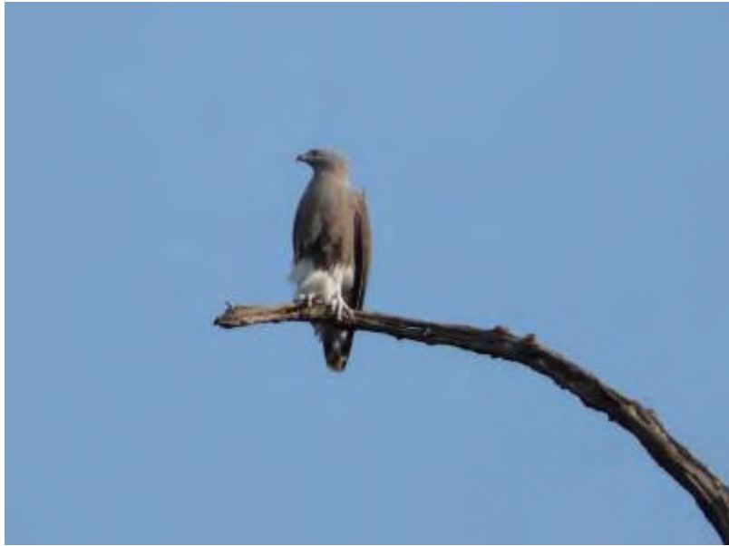
Lesser Fish Eagle

After an indifferent lunch, the group split up with some taking an elephant ride while the rest of us drove the trails through the nearby grasslands. Dhikala, is a lovely location and the opportunity it affords for the government to develop tourism in the area is seriously hampered by its surly legions of drivers and park officials permanently grinning as they stand about in the expectation of being given a tip.