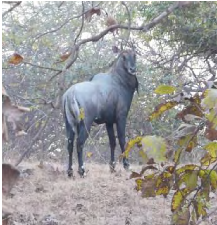
Nilgai ( Boscephalus tragocamelus ) Common in Gujarat.