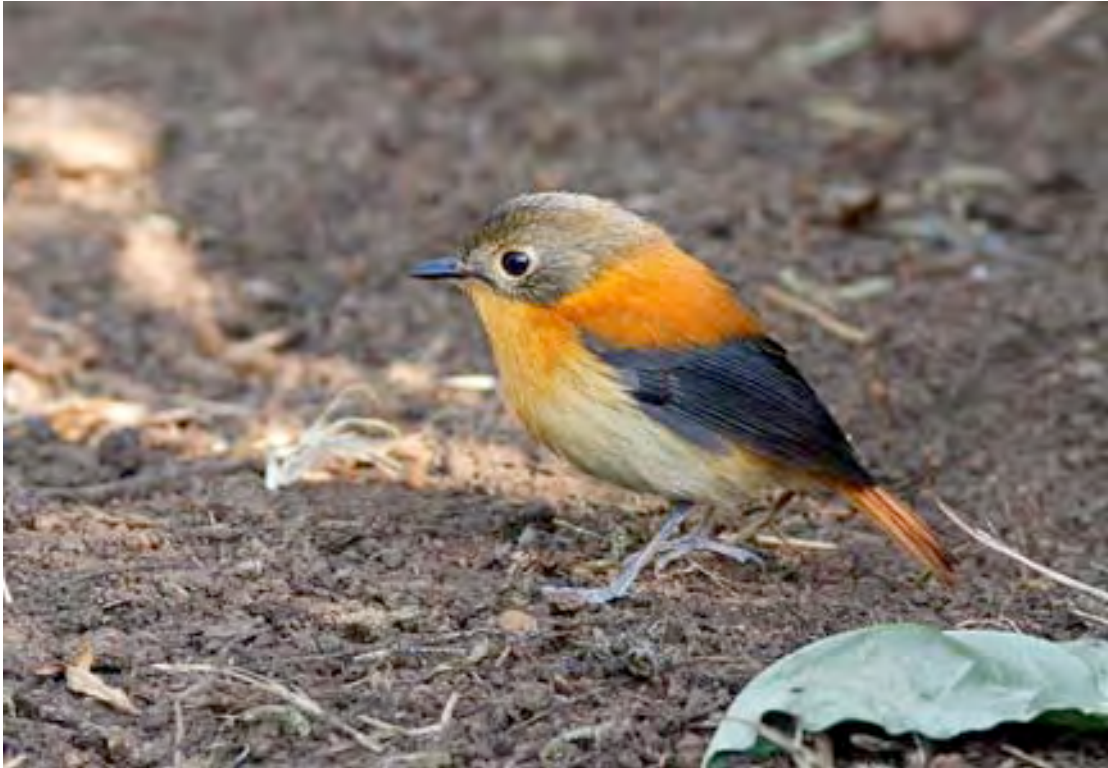
Female Black-and orange Flycatcher

Tickell's Blue Flycatcher Cyornis tickelliae Two singles seen.