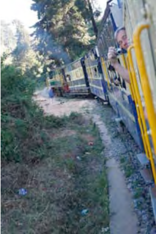
Ooty Steam Railway

A bit of pre-breakfast birding resulted in our first showing of 4-5 Nilgiri Laughingthrushes, three Nilgiri Wood pigeons and a Tickell's Warbler. After yet another great breakfast we noted another Black-and orange Flycatcher, some Velvet-fronted Nuthatches and about 15 Nilgiri Langurs. After lunch we drove to Conoor where we caught the "Toy train" of BBC fame back to Ooty. A train ride through the Nilgiri Hills was a great experience! A couple of Painted Bushquails were seen from the train by just a couple of people. Dinner was at the Glengarth Villa, another rather dilapidated mansion dating back to the days of the Raj.