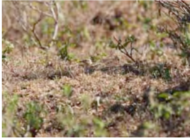
Syke's Larks by Graham Crick

Ashy-crowned Finch-lark Eremopterix griseus (Ashy-crowned Sparrow Lark) About a dozen near Mysore and a single female at the Syke's Lark site.