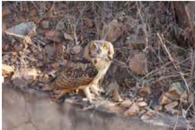
Juvenile Indian Eagle Owl

Indian Eagle-owl Bubo bengalensis Two adults and three juveniles at two sites near Mysore in one morning was an amazing experience.