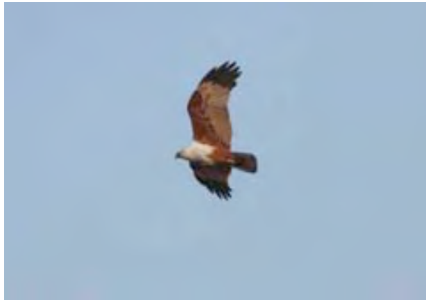
Brahminy Kite

Brahminy Kite Haliastur Indus Common throughout.