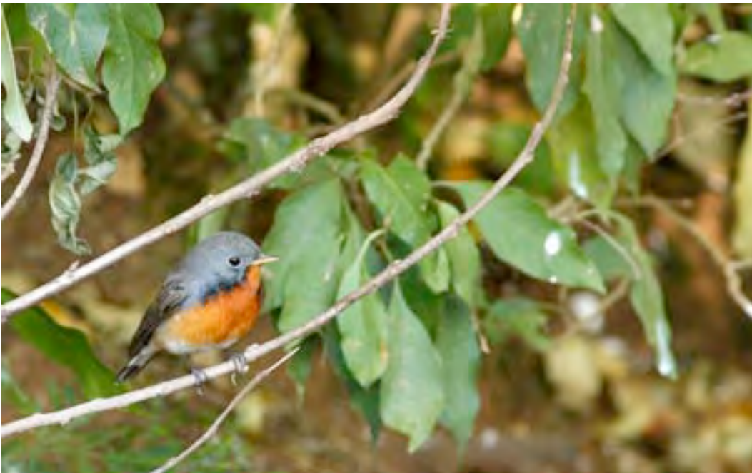
Male Kashmir Flycatcher

Kashmir Flycatcher Ficedula subrubra A male of this winter visitor at Ooty seen on two consecutive days, in the same place as last November.