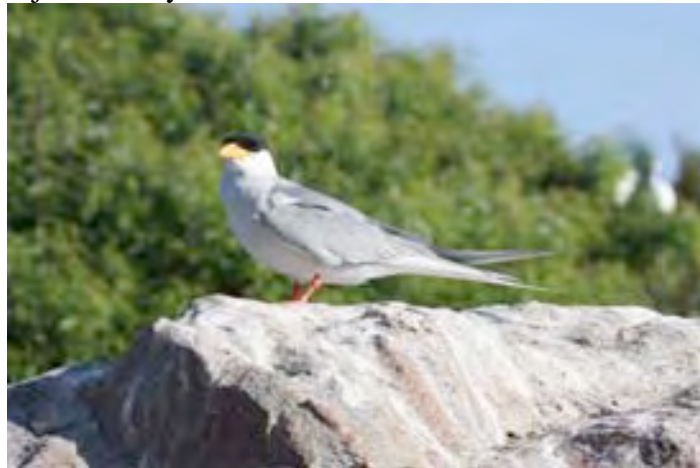
River Tern by Graham Crick

We continued on to Mysore and stopped at the Ransanathittu Bird Sanctuary where we boarded a rowing boat and were immediately surrounded by Painted and Open-billed Storks, Spot-billed Pelicans, Purple and Night Herons. Many Egrets too and all were breeding and therefore in their stunning breeding dress. Spoonbills, Greater Thick-knees were present too and we were able to approach a River Tern, one of six, to within just a few yards.